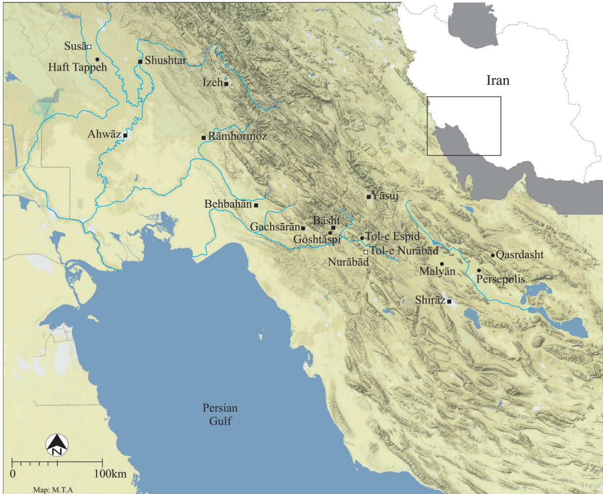
Fig. 1: The localization of Goshtāspi.