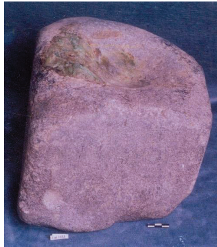
Fig. 3: the texts of the Door-Socket no. 1033