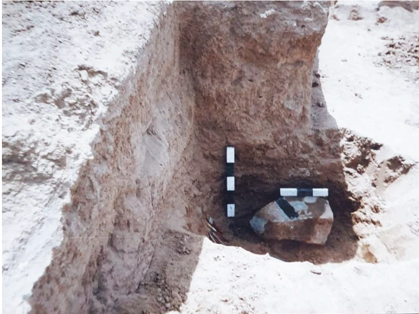
Fig. 4 a: The Text of the Door-Socket Um. 3634.