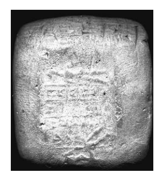
Figure 2: Letter (1) (TrDr 89), after CDLI P134762. The cylinder seal of the scribe has been impressed on the obverse of the clay tablet after the text was written (left); a clearer impression of the scribe's seal showing the inscription identifying the scribe was placed on the reverse of the tablet (right).