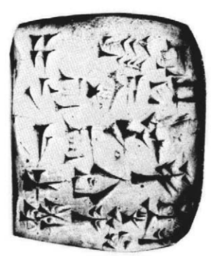
Figure 3: Letter (2) (MVN 3 352), obverse, after Owen 1975, Pl. 18. The seal is impressed on the reverse of the clay tablet (no illustration).